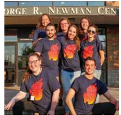
National Dominican Preaching in Action Conference, May 2018

The university is rooted in a proud, 800-year Dominican tradition of rigorous scholarship, committed teaching and ethical values. Serving a diverse population of all ages and faith backgrounds, Caldwell University provides an education that promotes spiritual, intellectual and aesthetic growth. In the Catholic humanist tradition, Caldwell strives to empower its students to be mindful of community and global issues. Annually, Founder's Day celebrates the spirit of the Dominican tradition that continues to influence life on campus.