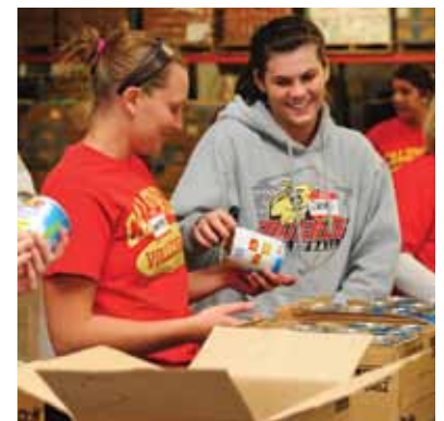
Annual Service Day