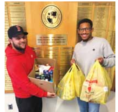
Service Saturday, April 2018 at Community Food Bank of NJ