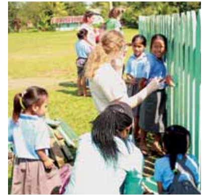
Campus Ministry, Belize 2019